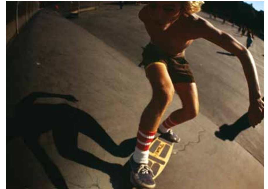
THIS PAGE, CLOCKWISE FROM ABOVE Sidewalk Surfer , 1976; In Your Face (Jay Adams), Kenter Canyon, 1976; Skate Snack , Del Mar (No. 50), 1975. OPPOSITE South Bay Gang , 1975.