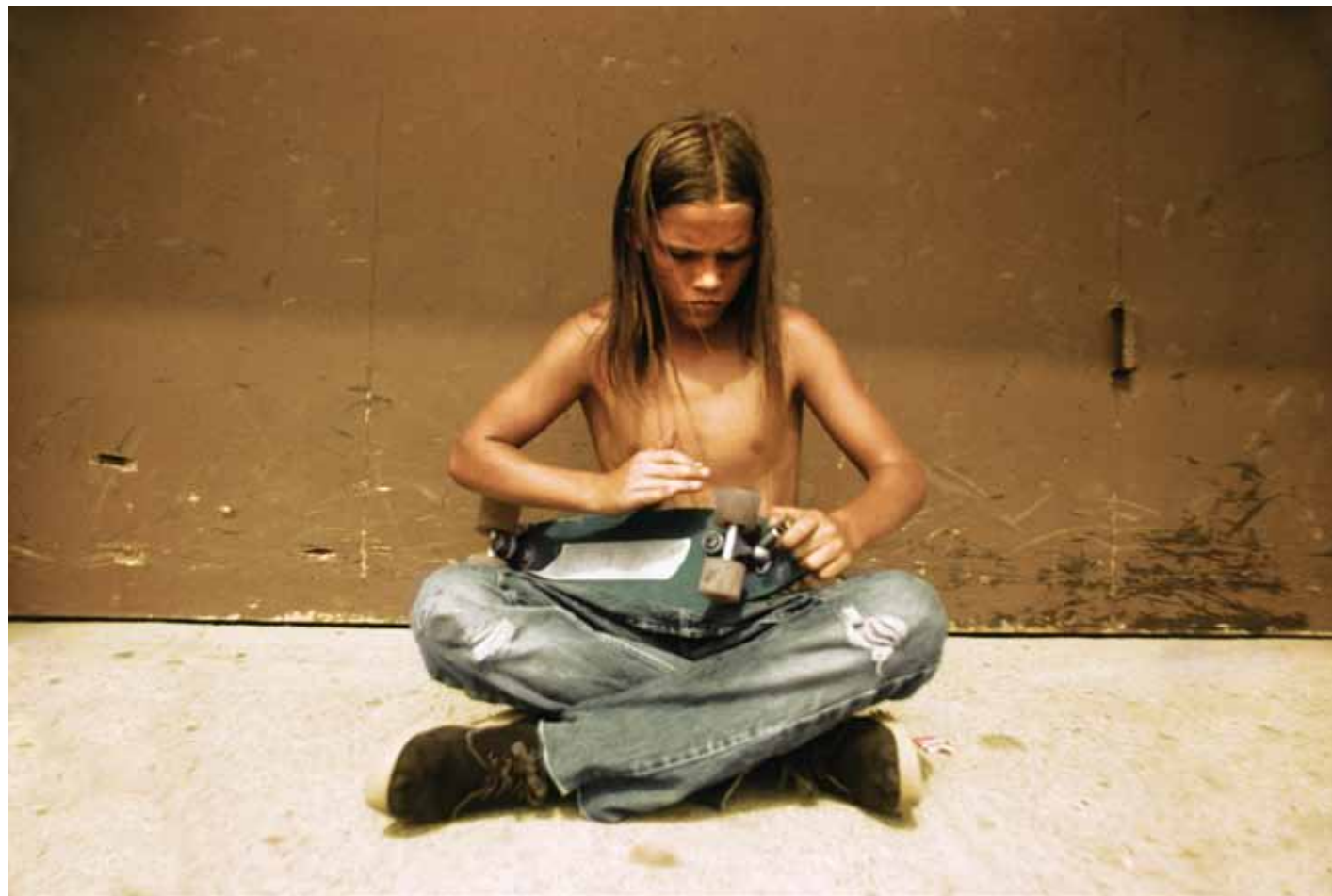
ABOVE Sidewalk Surfer Pit Stop, Huntington Beach (No. 70), 1975 Kenter Canyon, 1976.